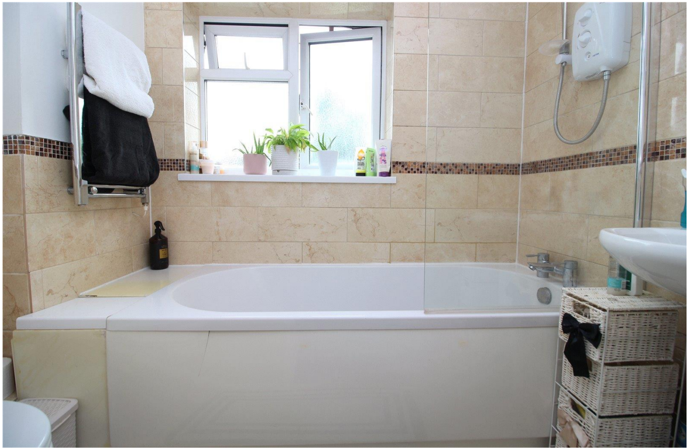
AN APPEALING TO BEDROOM END OF TERRACE HOUSE ON THE EDGE OF THIS POPULAR FIRST-TIME BUYER DEVELOPMENT.

Accommodation: There is an entrance hall with very generous storage cupboard. The double aspect living/dining room opens to the rear garden. There is an impressive modern kitchen that also overlooks the rear. The first floor landing leads to the two bedrooms and bathroom with window.