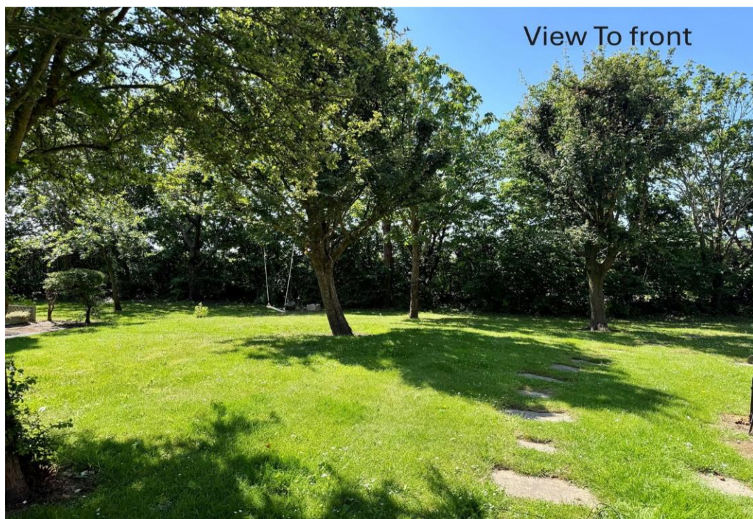
View To front