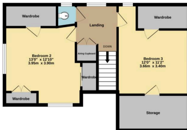
TOTAL FLOOR AREA: 1260 sq.ft. (117.1 sq.m.) approx.

Whilst every attempt has been made to ensure the accuracy of the floorplan contained here, measurements of doors, windows, rooms and any other items are approximate and no responsibility is taken for any error, omission or mis-statement. This plan is for illustrative purposes only and should be used as such by any prospective purchaser. The services, systems and appliances shown have not been tested and no guarantee as to their operability or efficiency can be given. Made with Metropix ©2025