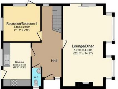
Ground Floor Floor area 63.1 sq.m. (679 sq.ft.) approx

21 Old Milton Road, Hampshire, BH25 6DQ | 01425 629100 | newmilton@pettengells.co.uk | www.pettengells.co.uk