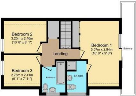
First Floor Floor area 45.4 sq.m. (489 sq.ft.) approx

This floor plan is for illustrative purposes only. It is not drawn to scale. Any measurements, floor areas (including any total floor area), openings and orientation are approximate. No details are guaranteed, they cannot be relied upon for any purpose and they do not form part of any agreement. No liability is taken for any error, omission or misstatement. A party must rely upon its own inspection(s).