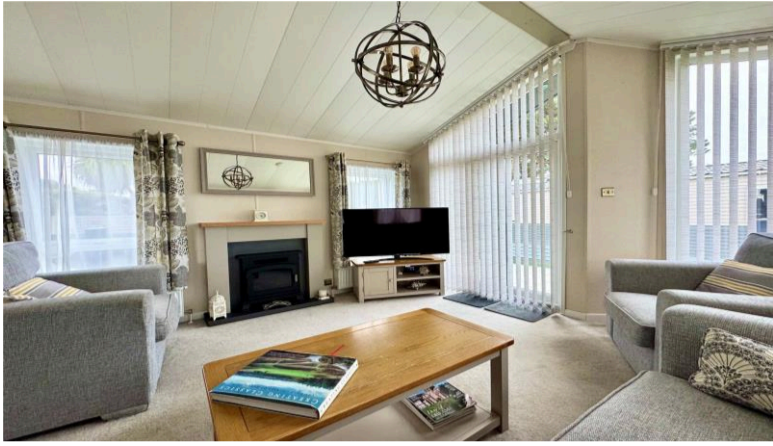
MODERN HOLIDAY LODGE ON SOUGHT AFTER SEASIDE HOLIDAY PARK.

Hoburne Naish is a wonderful holiday destination and enjoys amazing sea views and there is in fact a short cut from the development down to the beach. You don't need to leave the park to have a great holiday and there is a great variety of activities to keep you and the family occupied, and the park is also dog friendly. The New Forest is just a short drive away. Paulton's Park and Beulieu Motor Museum are close enough for an enjoyable day trip. If you're searching for a holiday lodge with an understated class that doesn't skimp on luxurious comfort, come and look no further than this Atlas Azalea 43' x 13' lodge, offering great holiday accommodation. In conclusion, this lodge offers a true home from home feeling with all the benefits of being by the seaside.