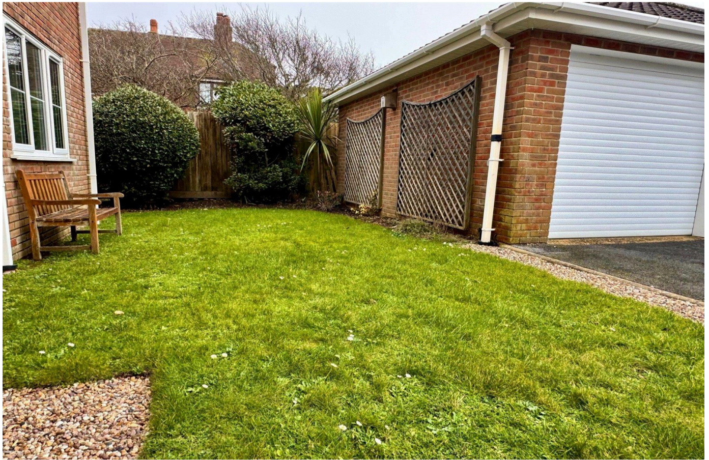
SUPERB SPACIOUS APARTMENT, CLOSE TO SEAFRONT AND LONG MEADOW.

We are pleased to offer this spacious and well appointed two bedroom ground floor flat with south facing patio to the rear (part of the communal grounds), garage, share of freehold, two bathrooms, and just a short walk to Barton beach.