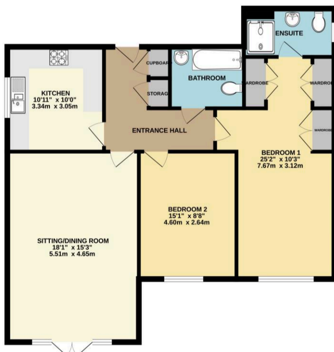
TOTAL FLOOR AREA - 1006 sq.ft. (93.5 sq.m.) approx. Whilst every attempt has been made to ensure the accuracy of the floorplan contained here, measurements of doors, windows, rooms and any other items are approximate and no responsibility is taken for any error, omission or mis-statement. This plan is for illustrative purposes only and should be used as such by any prospective purchaser. The services, systems and appliances shown have not been tested and no guarantee is given as to their operability or efficiency can be given. Made with Hologram 12/23