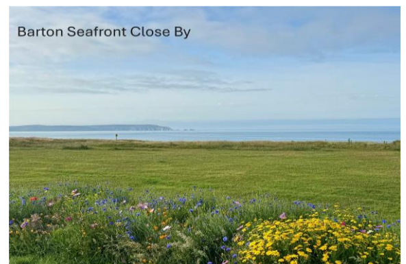
Barton Seafront Close By