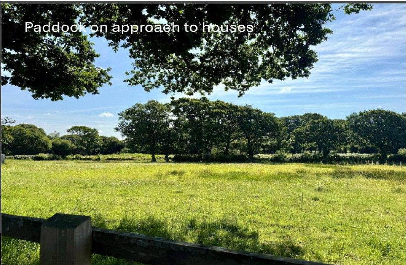
Paddock on approach to houses

SPLENDID BRAND NEW HOMES NOW FINISHED AND READY TO VIEW. SITUATED ON THE EDGE OF HORDLE VILLAGE.