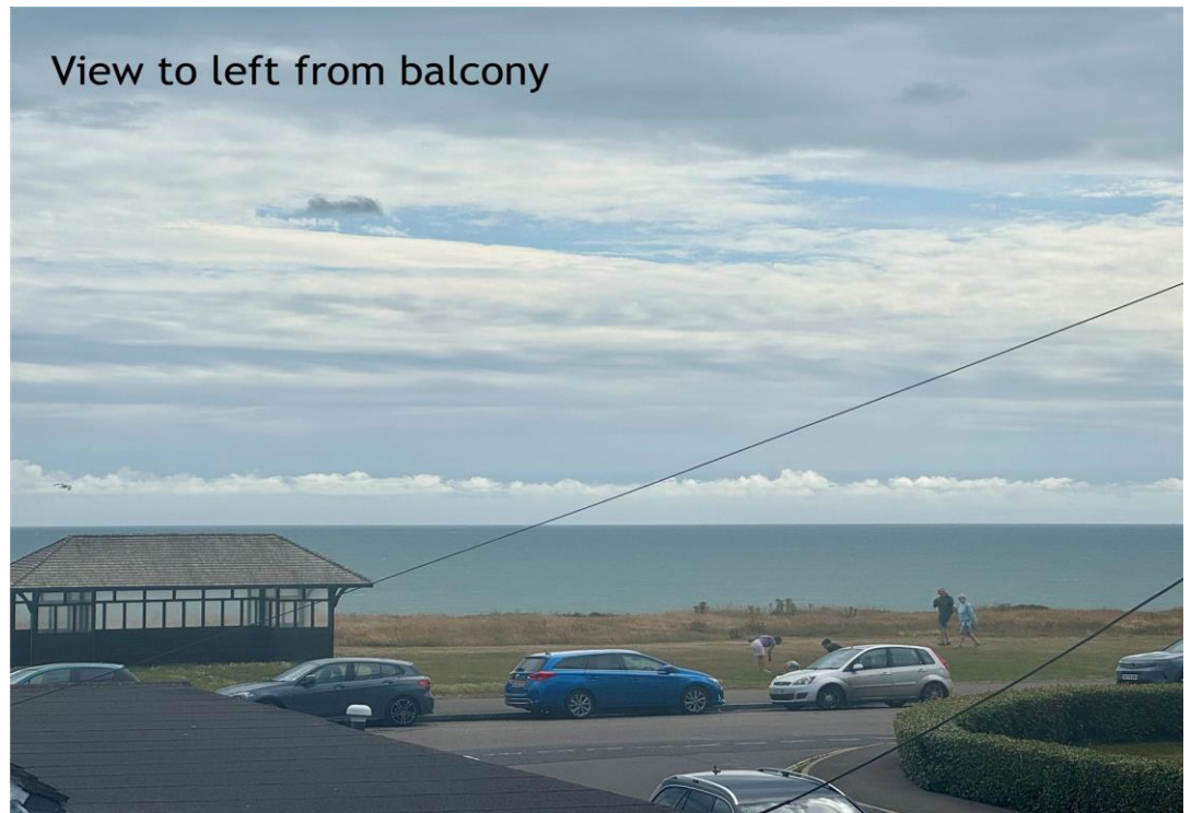
View to left from balcony