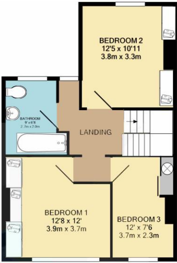
1ST FLOOR APPROX. FLOOR AREA 512 SQ.FT. (47.6 SQ.M.)

TOTAL APPROX. FLOOR AREA 1432 SQ.FT. (133.0 SQ.M.) Whilst every attempt has been made to ensure the accuracy of the floor plan contained here, measurements of doors, windows, rooms and any other items are approximate and no responsibility is taken for any error, omission, or mis-statement. This plan is for illustrative purposes only and should be used as such by any prospective purchaser. The services, systems and appliances shown have not been tested and no guarantee as to their operability or efficiency can be given. Made with Metropix ©2020