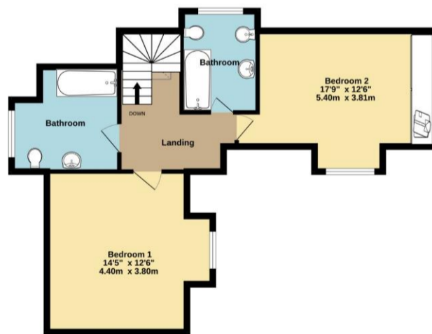
TOTAL FLOOR AREA: 1610 sq.ft. (149.6 sq.m.) approx.

Whilst every attempt has been made to ensure the accuracy of the floorplan contained here, measurements of doors, windows, rooms and any other items are approximate and no responsibility is taken for any error, omission or mis-statement. This plan is for illustrative purposes only and should be used as such by any prospective purchaser. The services, systems and appliances shown have not been tested and no guarantee as to their operability or efficiency can be given. Made with Metropix ©2025