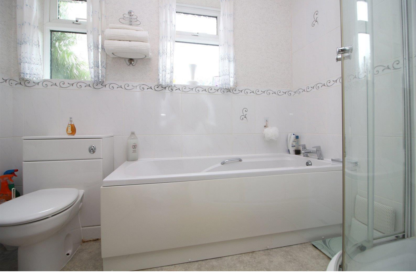
IMPRESSIVE BUNGALOW SITUATED IN A QUIET TUCKED AWAY LOCATION, ALBEIT CONVENIENTLY LOCATED CLOSE TO NEW MILTON TOWN CENTRE, LOVELY GARDEN WITH GARDEN LODGE, OFFERED CHAIN FREE.

Accommodation: The entrance hall leads into a lovely living/dining room which is double aspect and overlooks the front and rear gardens. The kitchen also overlooks the rear garden. There are two double bedrooms each with fitted wardrobes and there is a bathroom which also has a separate shower cubicle.