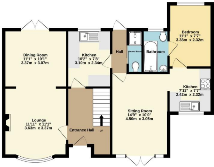
1ST FLOOR 627 sq.ft. (58.3 sq.m.) approx.

GROUND FLOOR 771 sq.ft. (71.6 sq.m.) approx.