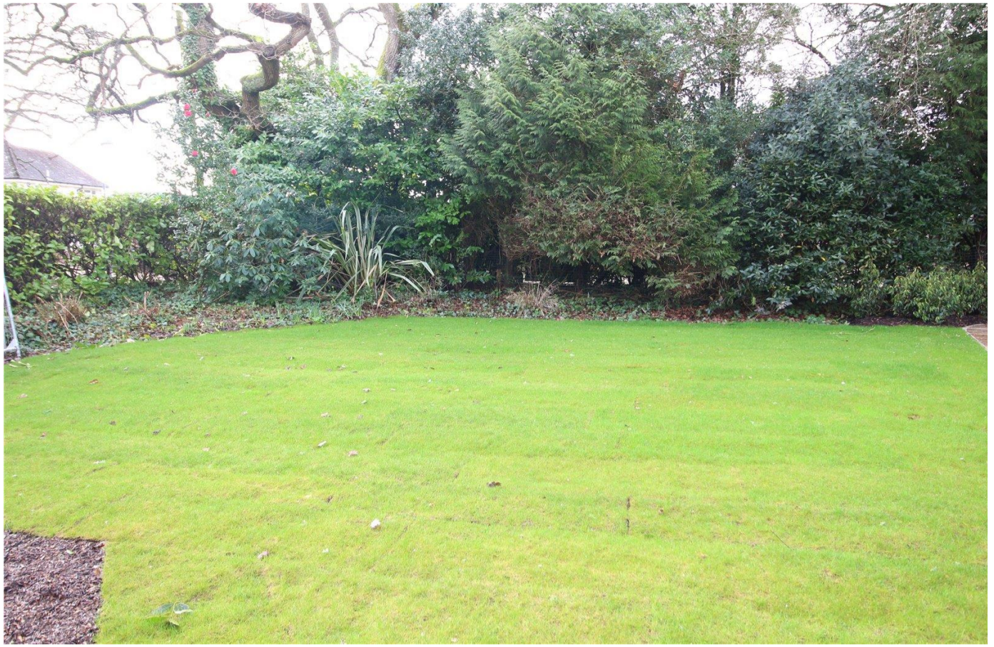
SPLENDID BRAND NEW SPACIOUS PENTHOUSE APARTMENT.

We are pleased to offer this exclusive development of 14 flats, in a sought after location close to the world renowned Chewton Glen Hotel and a short drive to the picturesque seaside towns of Lymington and Christchurch. All of the ground floor flats have their own garden and five of the upper apartments have balconies. The beach is a pleasant approx 1 mile walk from the development and Highcliffe village with a selection of shops and eateries is only just over half a mile away.