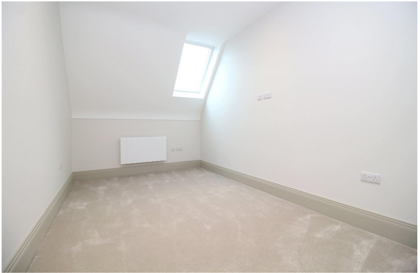
EXCEPTIONAL BRAND NEW PENTHOUSE APARTMENT.

Brought To You By 'Fortitudo', this luxury top floor flat.