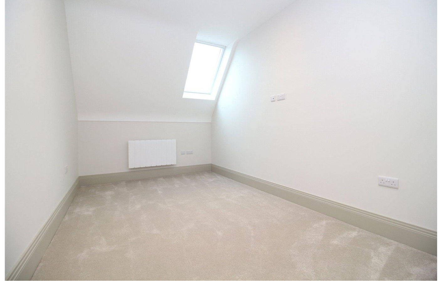
EXCEPTIONAL BRAND NEW PENTHOUSE APARTMENT.

Brought To You By 'Fortitudo', this luxury top floor flat.