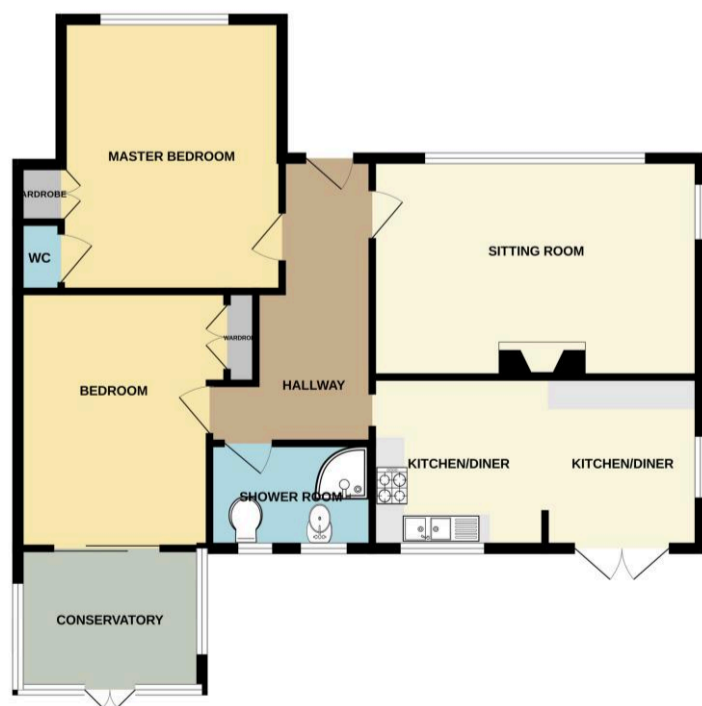
TOTAL FLOOR AREA: 880 sq.ft. (81.7 sq.m.) approx. While every attempt has been made to ensure the accuracy of the description contained herein, measurements of areas, windows, rooms and any other items are approximate and the responsibility is taken for any error, omission or mis-statement. This plan is for illustrative purposes only and should be used as such by any prospective purchaser. The services, systems and appliances shown have not been tested and no guarantee as to their operability or efficiency can be given. Made with Hoxpox 12/24