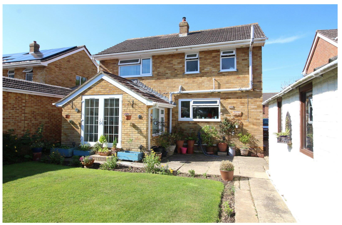
IMPRESSIVE DETACHED HOUSE, CONVENIENTLY SITUATED BETWIXT NEW MILTON TOWN AND BARTON SEA FRONT

Accommodation: The entrance hall also has a home office/study area. This leads into the bright living room which in turn opens to the original dining room. The extension at the rear is now used as the dining room and this has an attractive outlook over the rear garden, as does the kitchen. Upstairs there are three bedrooms plus a shower room and a second WC.