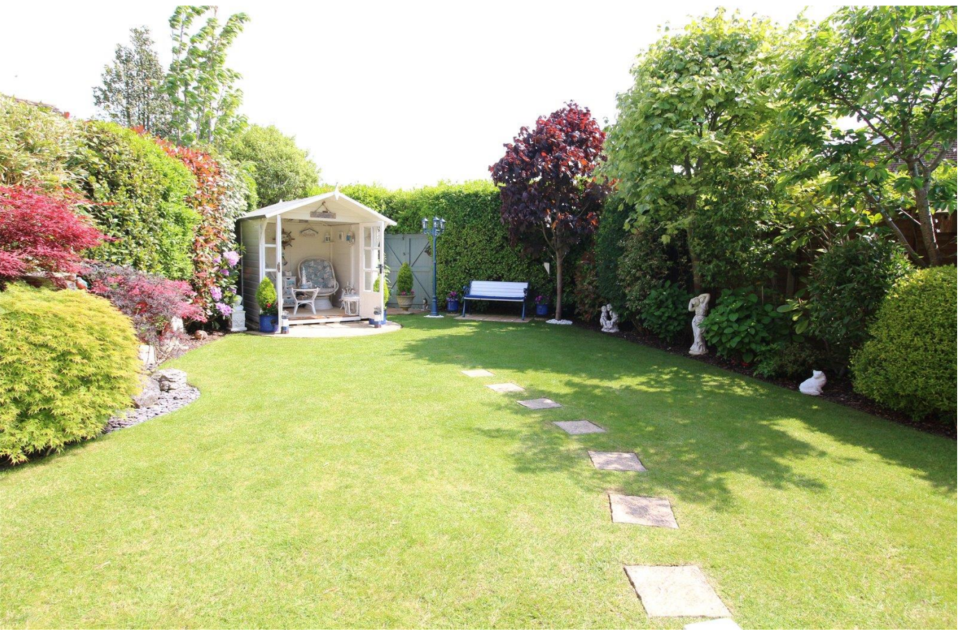
SPLENDID THREE BEDROOM DETACHED RESIDENCE BETWIXTED NEW MILTON TOWN AND BARTON SEA FRONT.

Accommodation: The entrance hall leads into the superb large L-shaped living/dining room(with integrated sound system). There is a well appointed kitchen with underfloor heating and with extensive integrated Neff appliances comprising fridge, freezer, dishwasher, washing machine, oven, five burner gas hob and extractor hood. At the front of the property there is a ground floor third bedroom but this could equally be a further reception room. There is a downstairs cloakroom. Upstairs the first floor landing leads to two good sized bedrooms that both have excellent built in wardrobes and extensive under eave storage. There is an ensuite bathroom to bedroom one and an additional bathroom adjoining bedroom two.