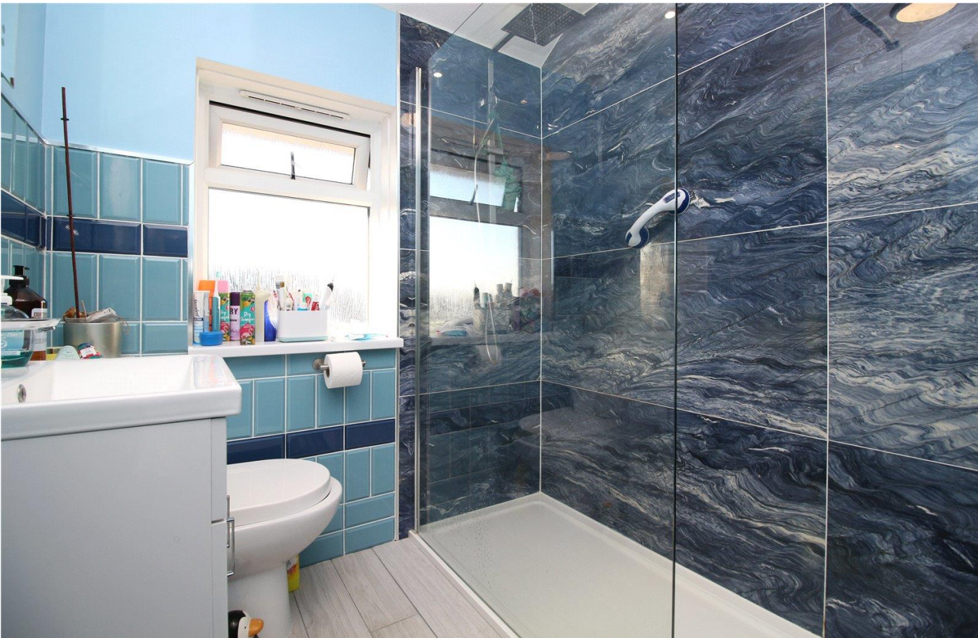
DETACHED FOUR BEDROOM HOUSE IN GREAT LOCATION BETWIXT TOWN AND BEACH.

Accommodation There is an entrance porch which opens to the hallway and this in turn leads into the living room which has an open plan design continuing into a dining room which opens out to the garden. There is then a well-appointed kitchen also overlooking the rear garden and a separate utility room and downstairs cloakroom. There is a further room that could perhaps be a study or ground floor fourth bedroom. The first floor landing leads to the three bedrooms with even bedroom three being a reasonable size, and there is an impressive shower room and a cloakroom next to it, so three WC's in total.