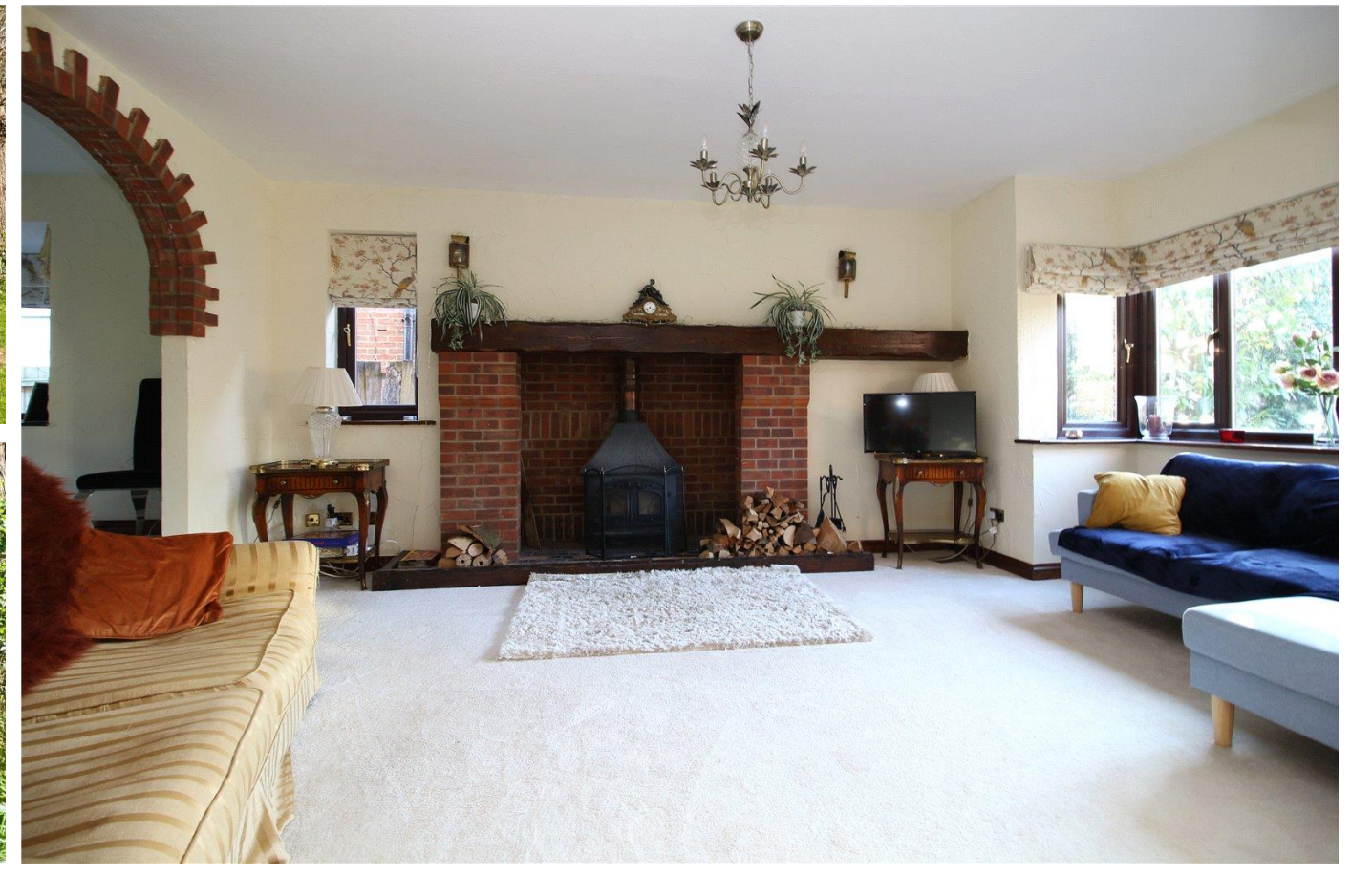
IMPRESSIVELY SPACIOUS INDIVIDUAL HOME!

We are pleased to offer this deceptively roomy detached residence which has flexible accommodation, currently including three reception rooms and a bedroom with en suite downstairs, and five further bedrooms upstairs. Extensive mature gardens and lots of off road parking.