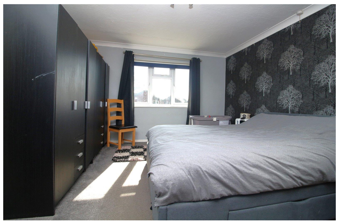
EXTENDED THREE BEDROOM HOUSE, ON POPULAR DEVELOPMENT!

We are pleased to offer this three bedroom end of terrace house, with features including 25' living/dining room, and viewing recommended.