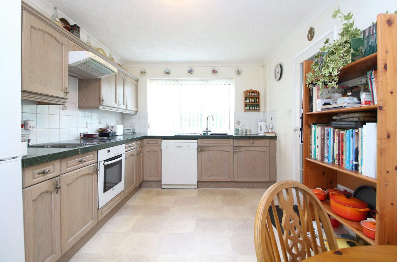
IMPRESSIVE DETACHED FOUR BEDROOM HOUSE ON THE EDGE OF THE EVER POPULAR CREST DEVELOPMENT ON THE FRINGES OF NEW MILTON AND CLOSE TO OPEN FARM LAND.

Accommodation: There is an entrance hall leading to the living room and this in turn leads to the lovely conservatory. A dining/family room then opens to the kitchen/breakfast room. There is also a downstairs cloakroom, and a utility area at the rear of the integral garage. The upstairs landing in turn accesses the four well proportioned bedrooms. Bedroom one has an ensuite shower room and there is a family bathroom.