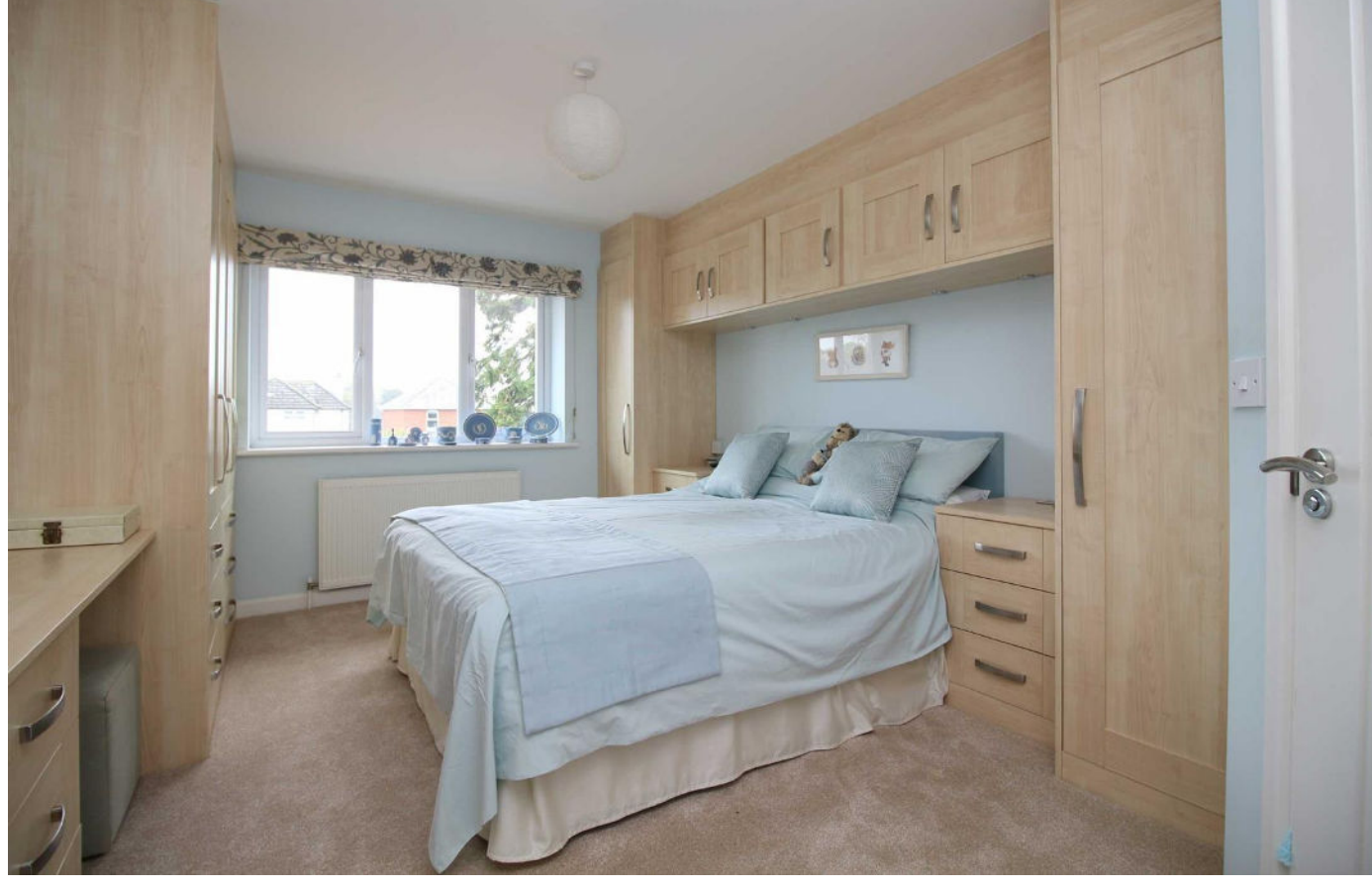
VERY SPACIOUS HOUSE IN VILLAGE LOCATION!

On a lovely gated development, we are pleased to offer this most impressive four bedroom semi-detached house with features including an en-suite to compliment the main bathroom, a study as well as a 17' living room and a well appointed 19' modern kitchen/family room.