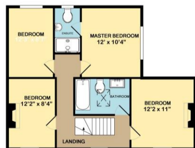
1ST FLOOR APPROX. FLOOR AREA 649 SQ.FT. (60.3 SQ.M.) TOTAL APPROX. FLOOR AREA 1381 SQ.FT. (128.3 SQ.M.)

While every attempt has been made to ensure the accuracy of the floor plan contained here, measurements of floors, windows, rooms and any other items are approximate and no responsibility is taken for any error, omission, or misstatement. This plan is for illustrative purposes only and should be used as such for any prospective purchase. The services, systems and appliances shown have not been tested and no guarantee as to their operability or efficiency can be given. Made with Metreplan 02/017