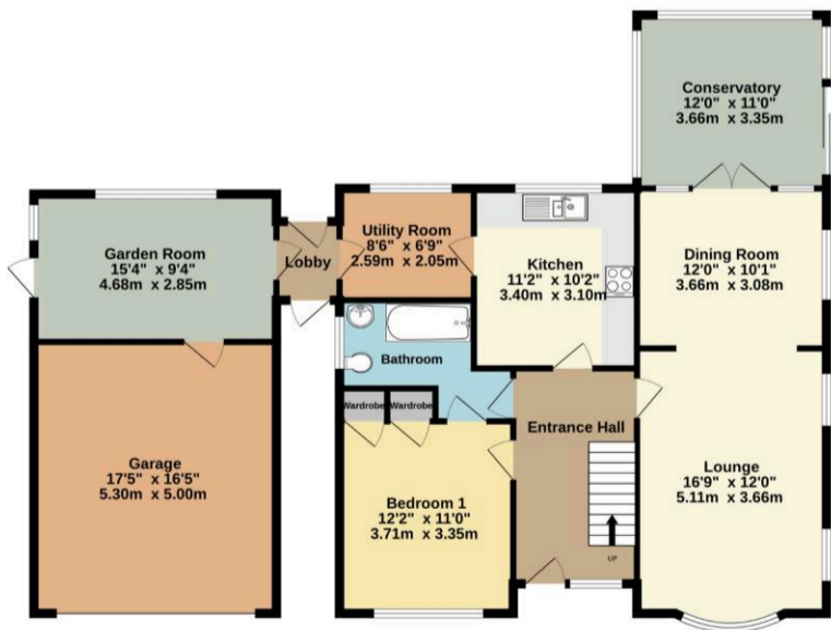
1ST FLOOR 483 sq.ft. (44.9 sq.m.) approx.